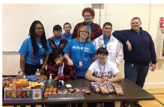
November annual Blood Drive