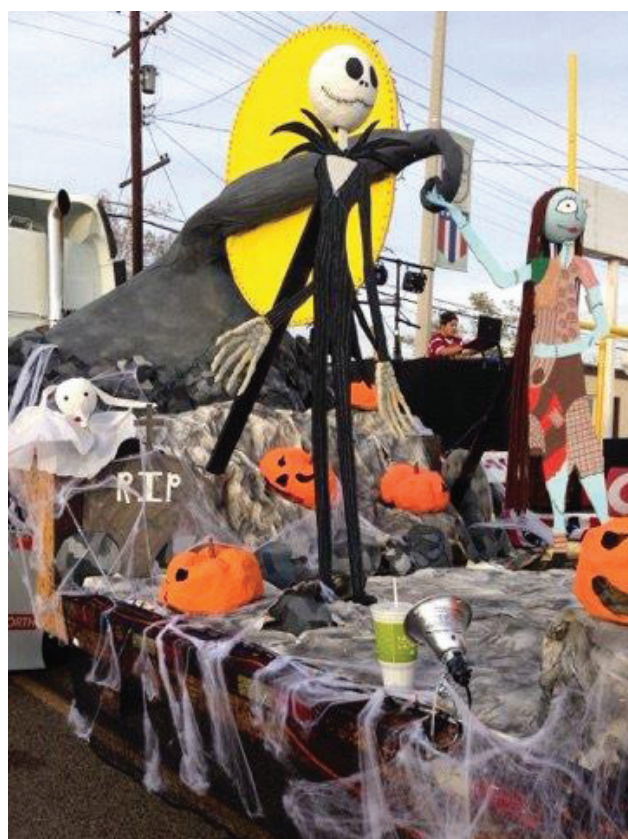
In October, the CHS ASB float "The Nightmare before Christmas," for Barstow's Mardi Gras Parade, which won second place.

Central High School Staff and Students will continue to focus on "Making Positive Connections" throughout this school year by continuing to create more specific ways to support our students' positive choices and ensure their success, both academically and socially.