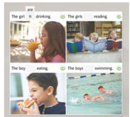
"Grammar Practice in Rosetta Stone Level 1"

so the user must also know the word "swimming" to respond correctly.