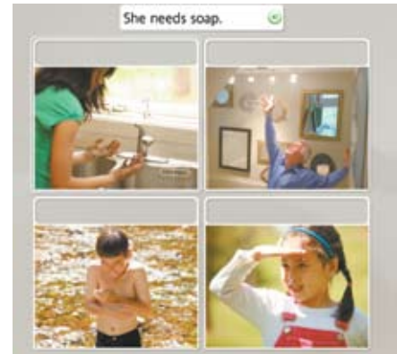
"Reading Practice in Rosetta Stone Level 1"

READING: The vivid photos and realistic situation portrayals make reading more interesting. Visual supports can be helpful for students learning to read and write, especially students on the autism spectrum. Some screens in Rosetta Stone are designed to reinforce reading skills. The written word or phrase appears, but is not spoken, and the learner must discern which photo best matches the phrase. Some screens use text as a prompt at the top of the screen to be matched with pictures or text boxes below. For example, one screen might have a prompt, "The dog is swimming." There are four pictures, one of a dog swimming in the water, a close-up of the face of a dog, a close-up photo of a horse and one of a horse running. Just knowing the word "dog" isn't enough because there are two pictures of dogs,